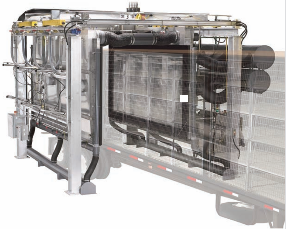
1/3 Truck Stunner

For more information about utilizing the Food Technology Laboratory's services, contact your Praxair representative or call us at 1-800-PRAXAIR. You can also visit our website at www.praxair.com/foodlab .