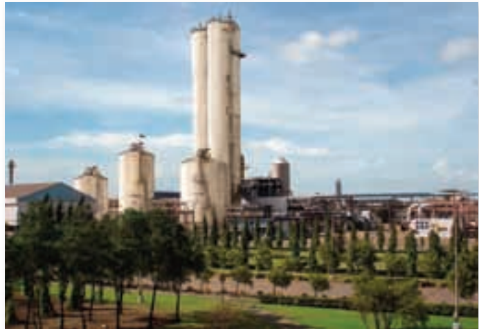
JSW, India: Steel – Electric drive