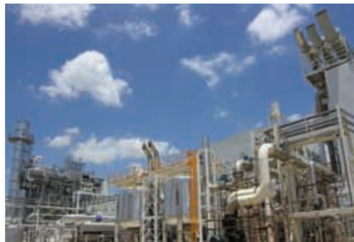
PEMEX, Mexico: Enhanced oil recovery – Natural gas drive