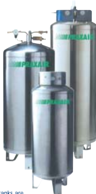
A variety of storage tanks are available to meet your specific needs.