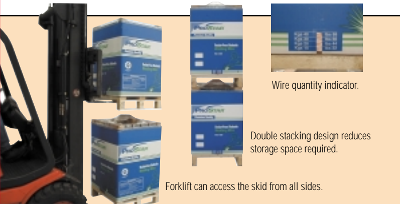
Wire quantity indicator.

Experience indicates the downtime per spool change is 15 minutes. 1200 lbs. = 7 hours of downtime savings.