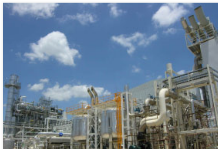
PEMEX, Mexico: Enhanced oil recovery – Natural gas drive