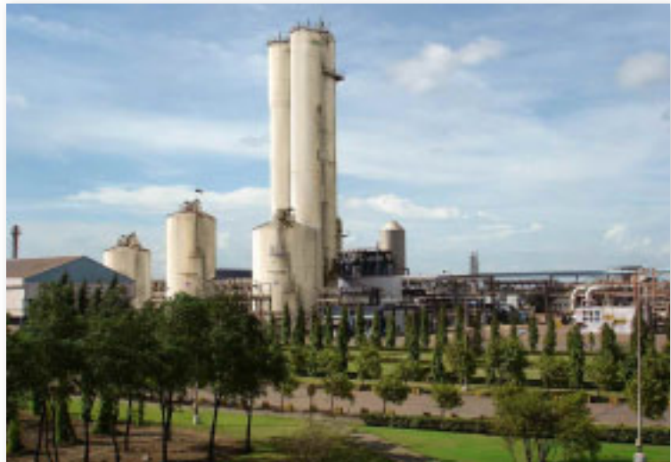
JSW, India: Steel – Electric drive