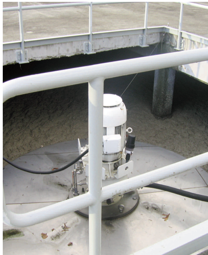
I-SO ™ installed in a UNOX™ aeration tank.